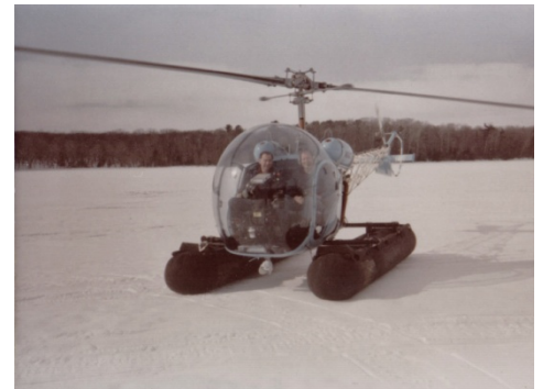
Bell-47 helicopter which I flew for many years