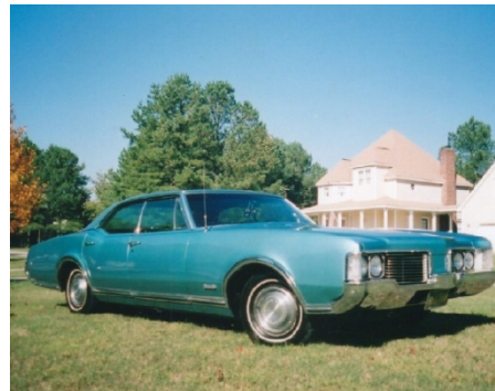
1968, Oldsmobile, Delta 88