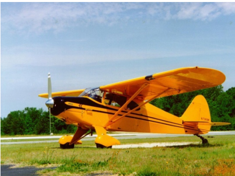
1950 Piper Pacer, PA-20