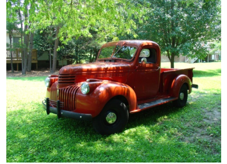
1946 Chevy pickup truck