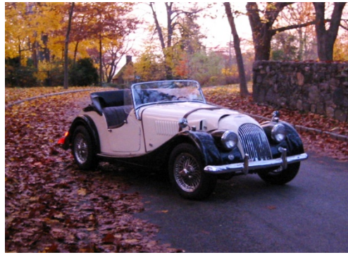
1957 Morgan +4